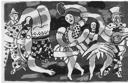
Fernand Leger, Cirque , complete set of 63 lithographs, Paris, 1950. ($25,000/$30,000). To be sold November 3 .

A grand array of Old Master through Modern Prints to be sold on Thursday, November 3 features Dürer, St. Anthony , engraving, 1519 ($20,000/30,000); Goltzius, The Large Hercules , engraving, 1589, ($12,000/18,000); Rembrandt etchings such as Self Portrait Drawing at a Window , 1648 ($40,000/60,000), Self Portrait in a Velvet Cap with Plume , 1638 ($25,000/35,000), The Artist Drawing from a Model , circa 1639 ($15,000/20,000), and Landscape with a Cottage and Haybarn , 1641 ($50,000/75,000); a complete