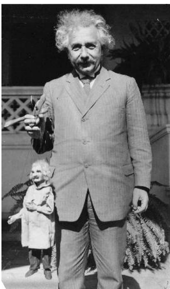
Albert Einstein with a Doll Representing Himself Which Was Used by the Yale Puppeteers in a Comic Drama Given by Them in Los Angeles, silver print, 1932, ($2000/3000), one of the vintage prints from the New York Times to be sold October 20.

Several works brought more than double their previous record prices at the sixth annual auction of Rare & Important Modernist Posters on April 21 . Highlights included Kandinsky's advertisement for the 2nd Salon Isdebsky , Munich, 1910, $29,900; Rodchenko's poster for the film One Sixth of the World , which he also helped shoot, 1926, $29,900; El Lissitzky's constructivist composition, Beat the Whites with the Red Wedge , printed circa 1926, $41,400, and his photomontage advertisement for the Russian exhibition at the Kunstgewerbe Museum in Zurich, USSR