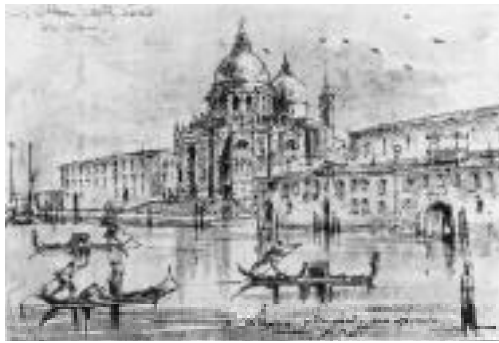
Circle of Canaletto, Santa Maria della Salute , pen and ink and wash, sold for $5750 on February 4.

Highlights of the morning session of Photographic Literature on February 11 included