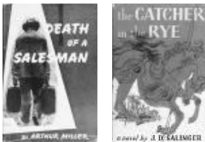
Modern first editions, (left) New York, 1949, inscribed and signed by Miller ($400/600), and (right) Boston, 1951 in first-stated dust jacket ($1500/2500), to be sold June 10.

The May 27 sale of Modern Press & Illustrated Books features livres d'artiste including a scarce, limited edition of Peret and Aragon's 1929 with four erotic photographic plates by Man Ray, Brussels, 1929 ($6000/7000); Rimbaud's Les Illuminations illustrated with 14 pochoir plates by Leger, one of 275 on velin teinte signed by Leger, Lausanne, 1949 ($2000/3000); and German Expressionist examples such as Goethe's Clavigo: ein Trauerspiel with 10 lithographs by Hugo Steiner-Prag, one of 25 signed, Weimar, 1917 ($1500/2500). Among fine modern press books are Crane's The Bridge , one of 200, Black Sun Press, Paris, 1930 ($1000/1500); and Wilde's Picture of Dorian Gray , one of 200, with 6 signed lithographs by Jim Dine, London, Petersburg Press, 1968, ($1500/2500). Choice L.E.C. publications include Joyce's Ulysses , illustrated by Matisse, one of 250 signed by both author and artist, New York, 1935 ($4000/6000); and Paz's Sight and Touch , with woodcuts after paintings by Balthus, one of 300 signed by both author and artist, New York, 1994 ($3000/4000). A fine copy of The Christopher Robin Story Book , New York, 1929 ($1000/1500), highlights a selection of books by A.A. Milne. Illustrators Edmund Dulac, Willy Pogany, and Arthur Rackham are well represented in the sale.