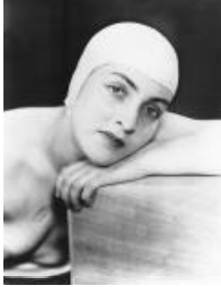
Man Ray, Meret Oppenheim in bathing cap, silver print, circa 1933, sold for $14,950 on April 27.

A very strong Photographs auction on April 27 again exceeded the million dollar mark. A unique vintage print of an Orchid Cactus by Imogen Cunningham, 1930-35, brought