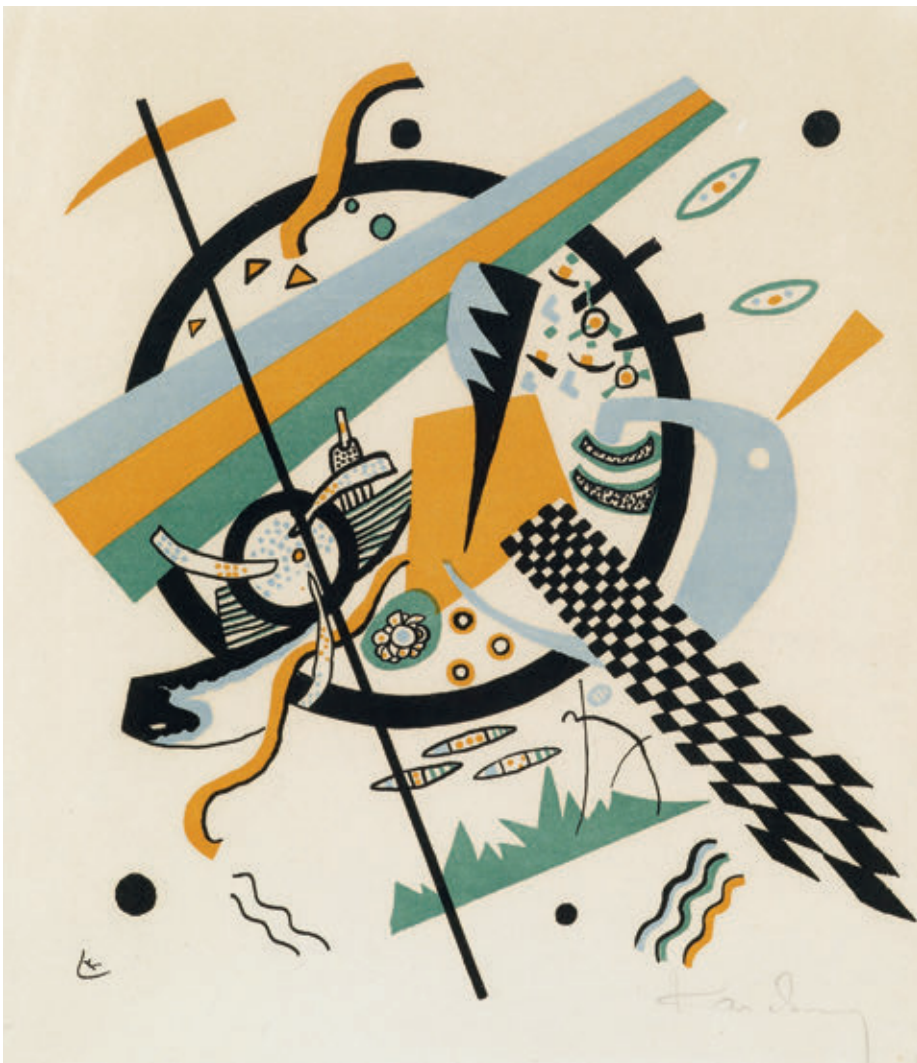
Wassily Kandinsky, Kleine Welten IV , color lithograph, 1922. $15,000 to $20,000.