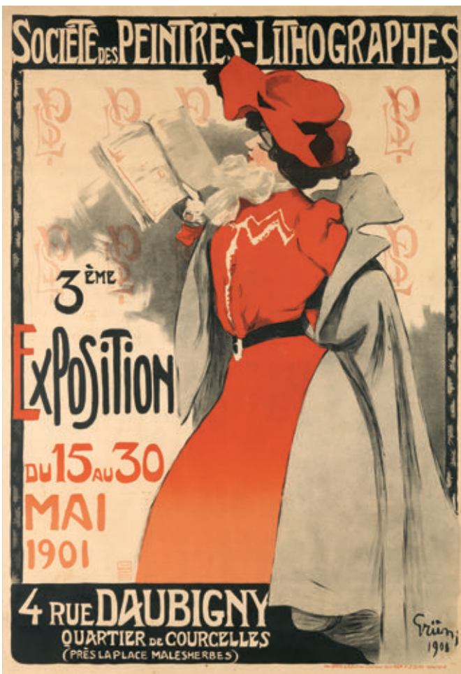
Jules-Alexandre Grün, Société des Peintres - Lithographes , 1901. $4,000 to $6,000. At auction February 25.

FOLD ALONG THE LINE AND SEAL WITH TAPE BEFORE MAILING