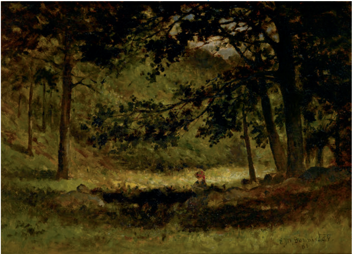
Edward M. Bannister, Untitled (Landscape with Woman Seated by a Stone Wall) , oil on canvas, 1881. $15,000 to $25,000.

This curated sale highlights the development of African-American artists in the 19th century and early 20th century—from Edward M. Bannister to Margaret Burroughs. The auction includes paintings, sculpture, drawings, fine prints and photographs by artists who emerged from the shadows of academic and genre painting and defined a new visual culture during the Harlem Renaissance and Works Progress Administration (WPA).