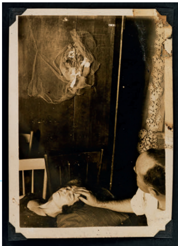
An album of 27 spiritualist photographs taken during séances at Dr. Thomas Glendenning Hamilton's Psychic Room in Winnipeg, Canada, 1920-22, sold December 12, 2013, for $93,750.

Swann has seen some impressive results for vernacular photography in recent months, and now our Photographs department is launching a sale devoted to rare 19th and 20th century albums, exceptional commercial images, eye-grabbing photographs by documentary or scientific practitioners, as well as fun three-dimensional photo objects.