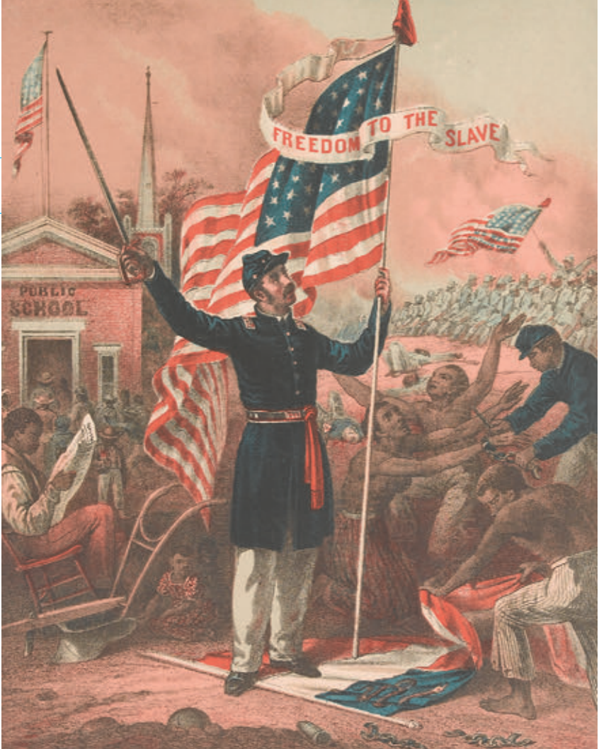
All Slaves Were Made Freemen by Abraham Lincoln , double-sided chromolithograph broadside, Philadelphia, 1863. $15,000 to $20,000.

Rounding out the sale is a rich selection of black film posters from the 1920s through the 1940s; a number of Black Panther Party artifacts, as well as items from the Apartheid era in South Africa and Nelson Mandela's scarce pamphlet I Accuse .