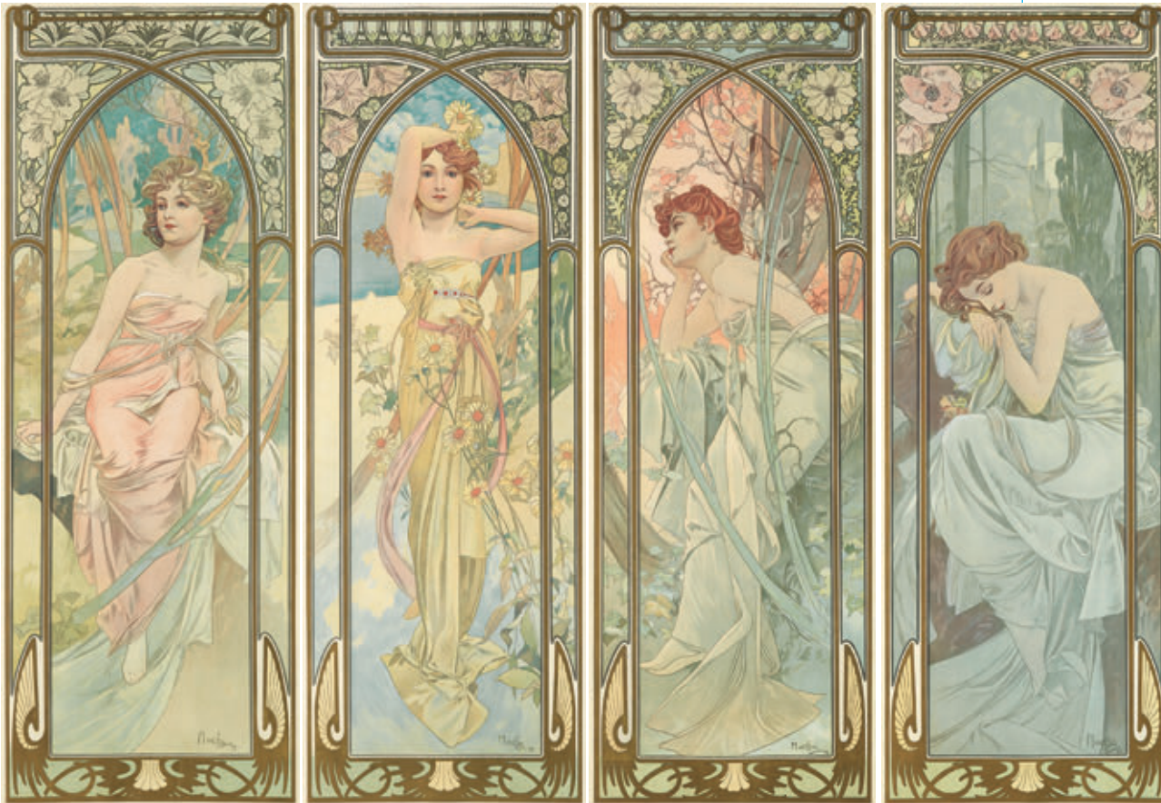
Alphonse Mucha, Times of the Day , group of four decorative panels, 1899. $50,000 to $75,000.