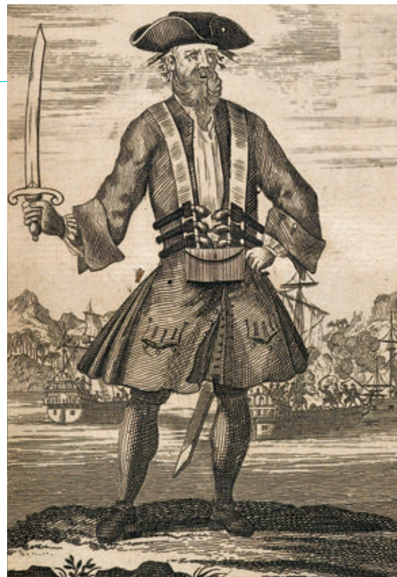
Charles Johnson, A General History of the Pyrates , London, 1724. $2,500 to $3,500.

Our April 8 Americana auction is still taking shape as of press time, but highlights will include a nice 1601 set of Herrera's Historia General de los Hechos de los Castellanos ; a first printing of the 1792 Act Establishing a Mint, and Regulating the Coins of the United States , signed by Thomas Jefferson; a rare 1860 report on the Young Men's Republican Union's extensive efforts to secure Lincoln's election; a collection of California gold rush graphics and much more.