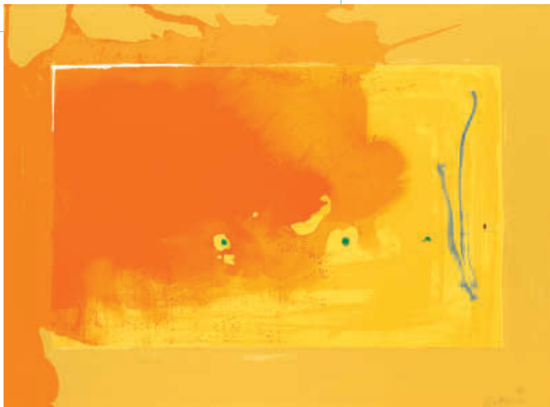
Helen Frankenthaler; Bilbao , color lithograph, 1998. $5,000 to $8,000.

Additional highlights include two monumental screenprints by Roy Lichtenstein from his Imperfect series, 1988; and a run of Warhol screenprints spanning his career, with Flowers , 1964, Liz , 1964, After the Party , 1979, Franz Kafka , 1980 and Martha Graham: Satyric Festival Song , 1986, among others.