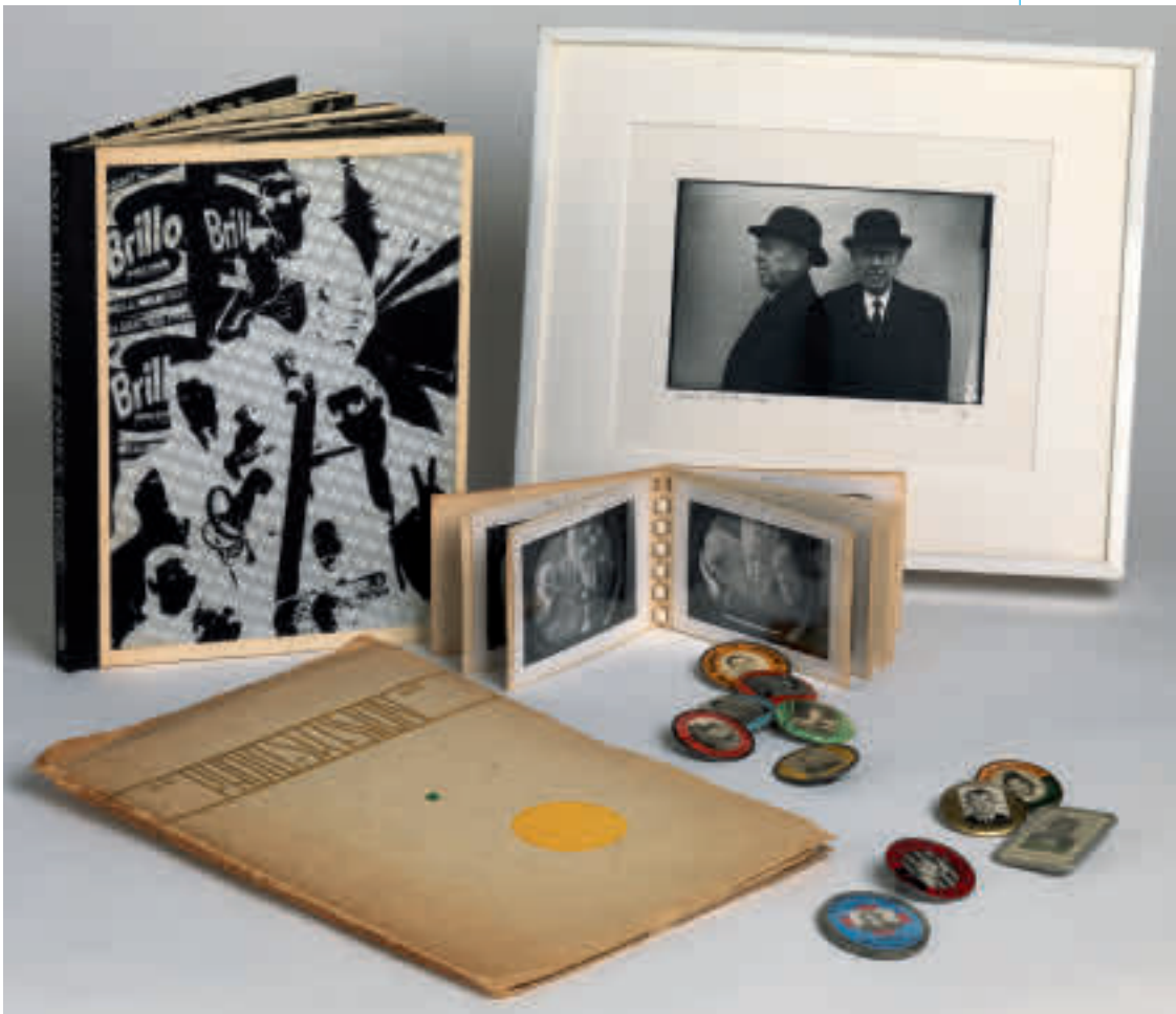
A selection from the auction: Andy Warhol's Index , a Duane Michals portrait of Magritte, an album with snapshots of a TV showing JFK's inauguration, WWII-era laborer ID badges and Photo-Secession .

Photobook highlights include Edward S. Curtis's 20 illustrated text volumes of The North American Indian and titles by Claude Cahun, Richard Prince and Francesca Woodman.