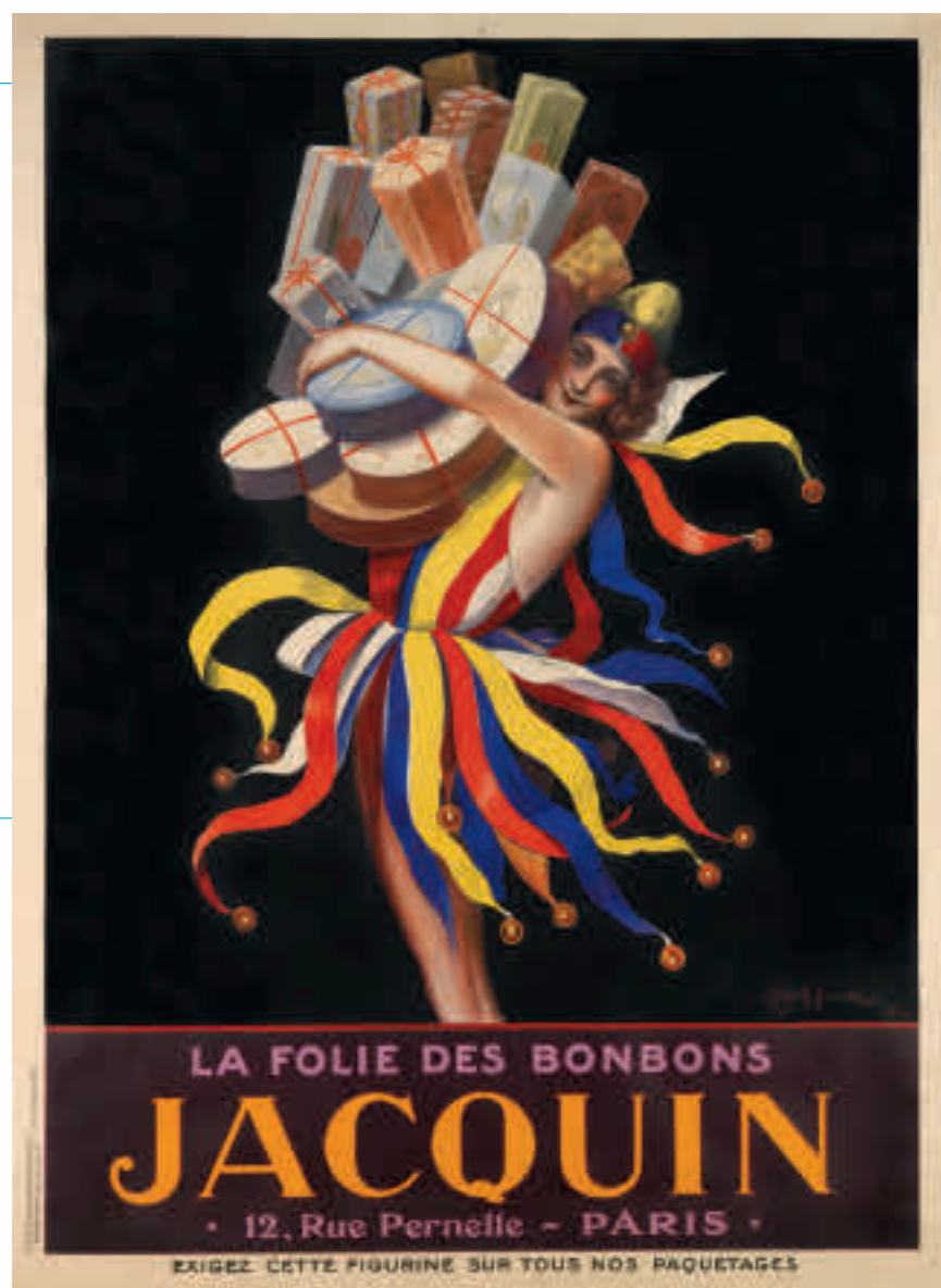
Leonetto Cappiello, La Folie des Bonbons / Jacquin , 1926. $4,000 to $6,000.

Alex Diggelmann, Gstaad , 1934. Sold February 12, 2015 for $30,000.